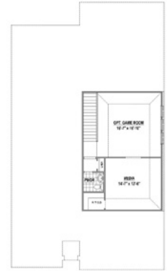
Optional Game Room, Media