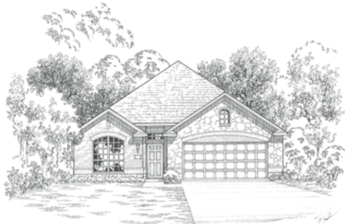
Elevation A with Stone