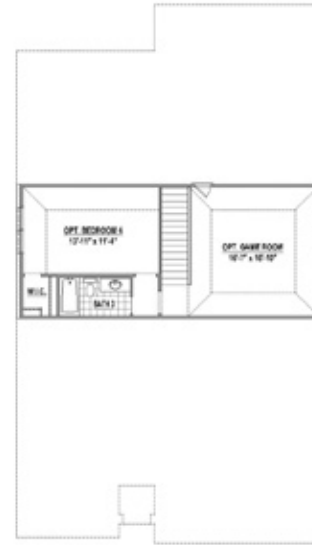
Optional Game Room Bedroom 4