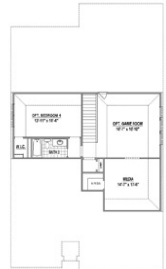
Optional Game Room, Bedroom 4, Media