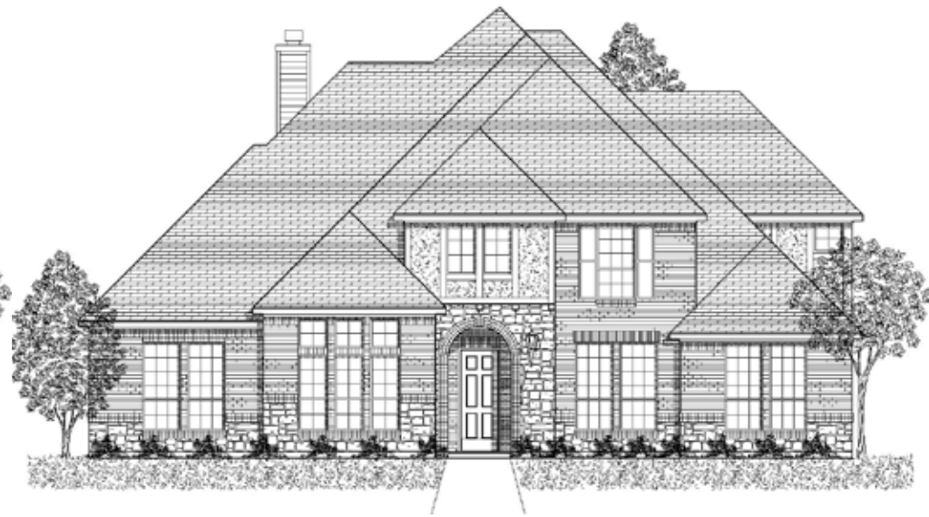
Elevation B with Stone