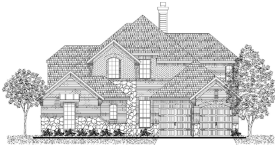
Elevation B with Stone