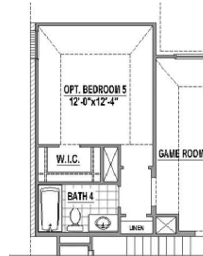
Optional Bedroom 5 with Full Bath