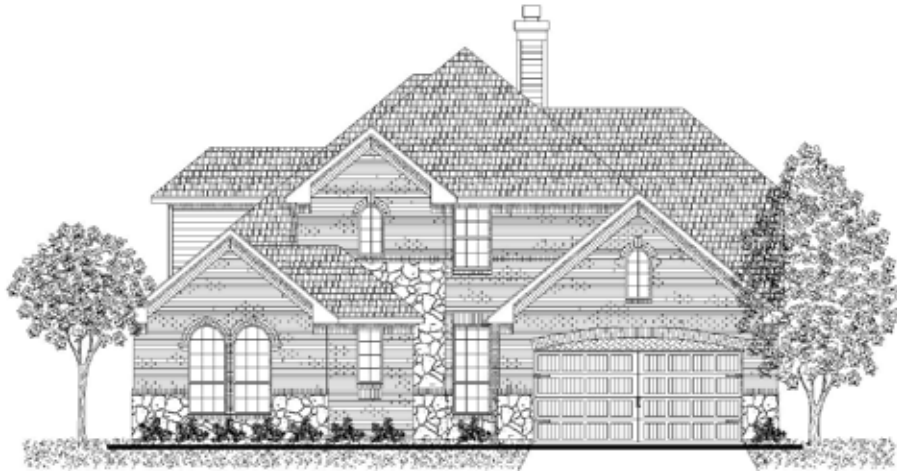
Elevation A with Stone