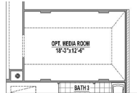
Optional Media Room