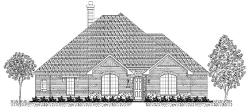
Elevation A with Stone