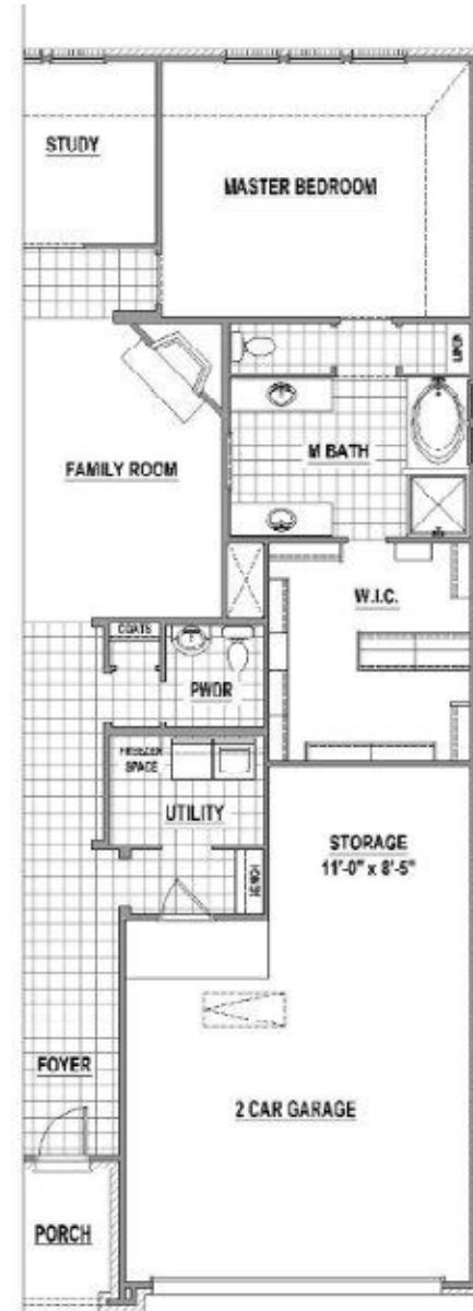
Optional Mater Bath