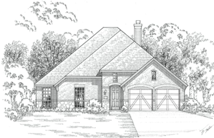
Elevation B with Stone