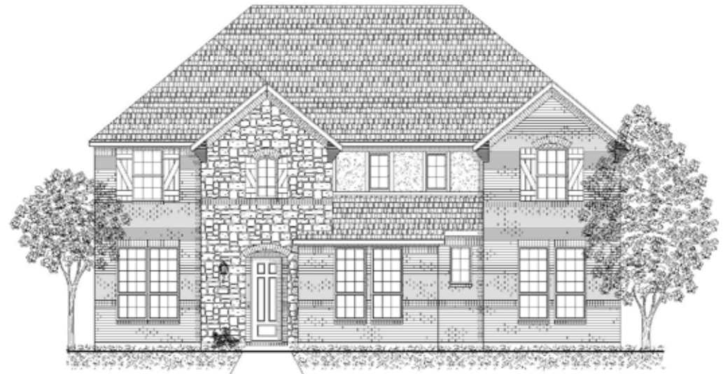
Elevation B with Stone