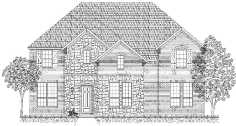
Elevation A with Stone