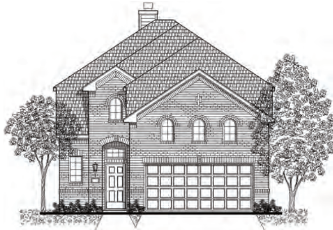
Elevation A with Media