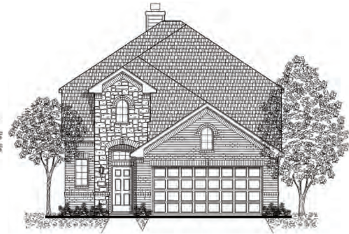
Elevation A with Stone