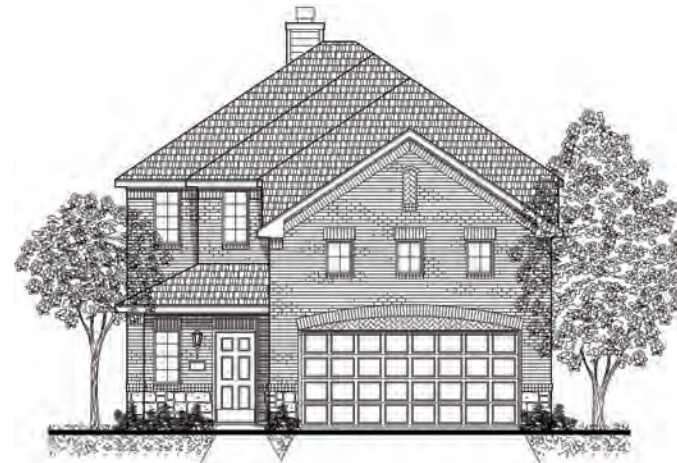
Elevation B with Media

Prices, plans, specifications, square footage and availability are subject to change without notice or prior obligation. Square footage is approximate and may vary upon elevations and/or options selected. Please see your Sales Counselor for more information.