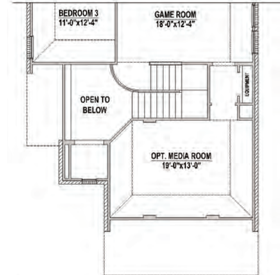
Optional Media Room