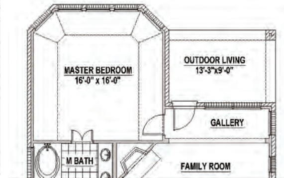
Optional Master Bay Window

Prices, plans, specifications, square footage and availability are subject to change without notice or prior obligation. Square footage is approximate and may vary upon elevations and/or options selected. Please see your Sales Counselor for more information.