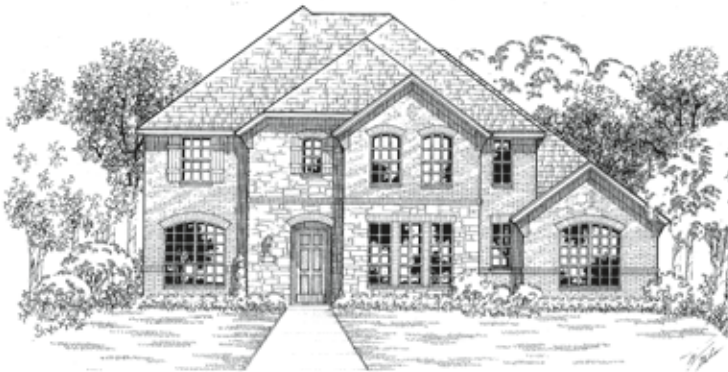
Elevation B with Stone