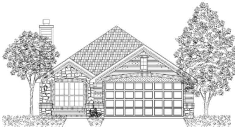
Elevation A with Stone