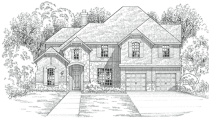
Elevation B with Stone