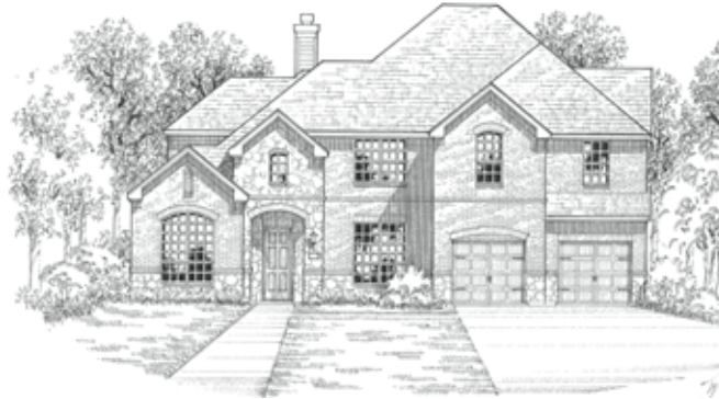
Elevation A with Stone