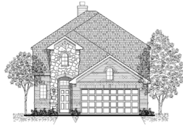
Elevation A with Stone