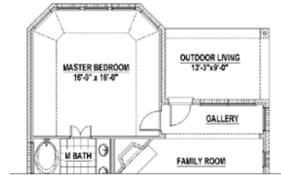
Optional Master Bay