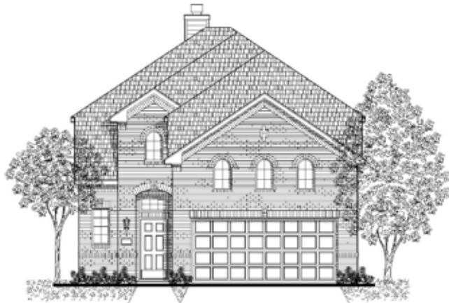
Elevation A with Media