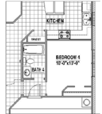
Optional Bedroom 4/Full Bath