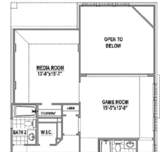
Optional Media Room