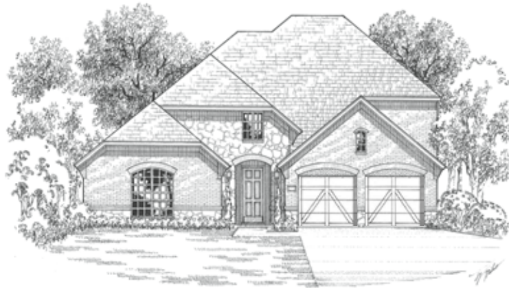
Elevation B with Stone