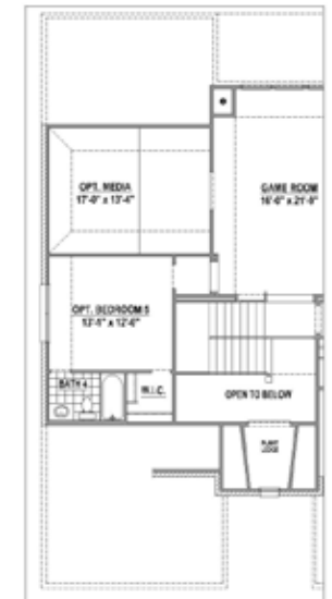
Optional Bedroom 5 & Media