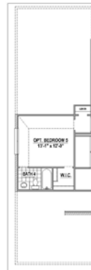
Optional Bedroom 5