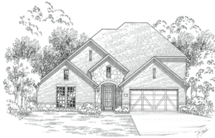
Elevation A with Stone